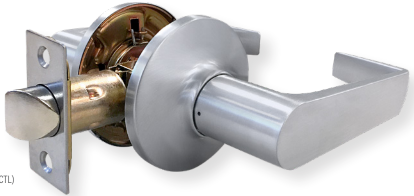
Cortland Trim (CTL)