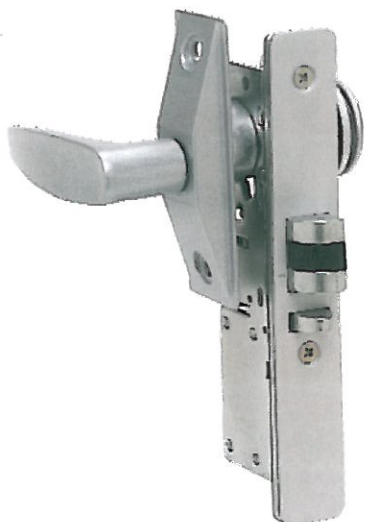
Deadlatch Lockset 1-1/8" AL LH*