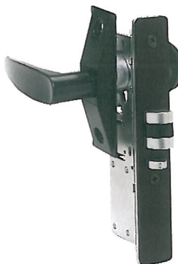
Deadlatch Lockset 1-1/8" Duro LH

NOTE: Levers & cylinders sold separately