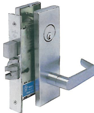
Escutcheon Mortise Lock MR TRIM Boston (BFEF) Trim